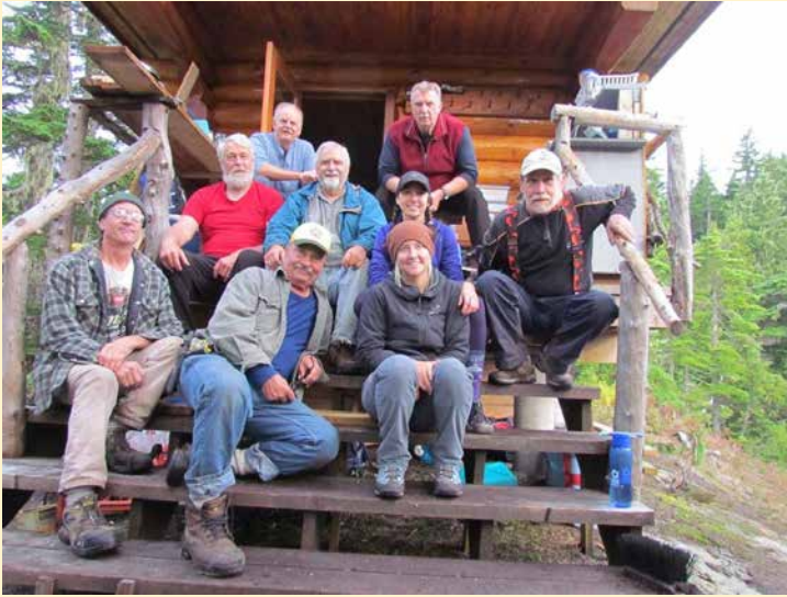
Mount Troubridge: PAWS board members, volunteers and a couple of hikers too!